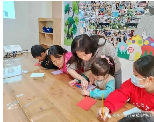
and "Dancing Leaves" Picture Book lesson