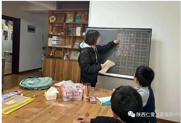
College students from Xi'an university came to volunteer and teach a calligraphy class,